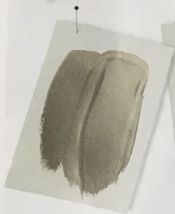
MOUSE'S BACK NO. 40 FARROW & BALL

"The most successful small spaces are dark and cozy, because—let's face it—it's impossible to make a tiny room feel airy and spacious. I love this warm brown, which is earthy and rich like the forest floor, paired with a crisp white ceiling. The contrast allows your eye to pick up on the edges of the space, giving it more volume."