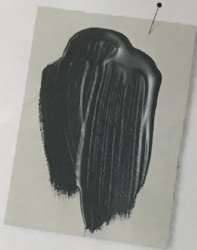
NARRAGANSETT GREEN HC-157 BENJAMIN MOORE

Short on square footage? Designers share strategies for rooms that go deep and bold—or light and bright.