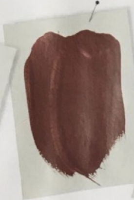
INCARNADINE NO. 248 FARROW & BALL

"When I suggested this classic red for a modest guest bedroom in Florida, I initially met some resistance from my clients. But they went for it, and, with Marrakech as my inspiration, I added a large antique bronze wall mirror and arabesque-patterned table lamps. The end result was dramatic and glamorous—they loved it!"