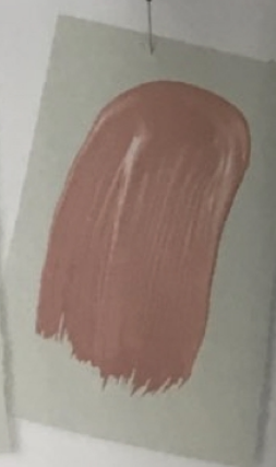
MINSTREL HEART 1297 BENJAMIN MOORE

"To make a tiny guest bedroom under the eaves of a Hamptons house into an intimate retreat, we painted the ceilings, walls, and trim a deep pink. Painting all of the room's elements the same color leaves the focus on the art, the fabrics, and the views out the windows. On sunny mornings the room glows, and in the evening, it feels warm and restful."