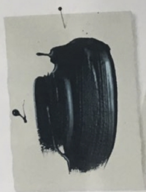
NIGHTSPOT C2-743 C2

"Deep, saturated colors give the illusion that the walls are receding. For a showhouse in San Francisco, I turned a small area into a home office, wrapping the space in indigo. By keeping furniture to just the essentials and adding art, bookshelves, and a unique light fixture, I created a dynamic, layered effect."