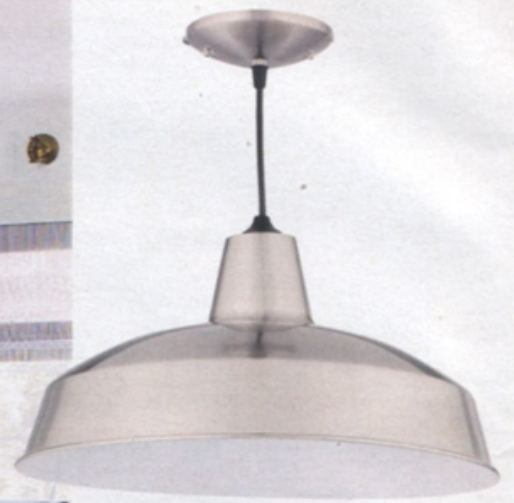
Hampton Bay Warehouse Pendant, $35, homedepot.com