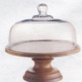
Isla Wooden Cake Stand, $60, pier1.com