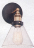
Burke Wall Sconce, $80, lampsplus.com

From the fluffy footstool to the contrasting curtain rod, Stewart strategically places decor above and below eye level. The result? A room that is well-balanced and looks bigger.