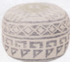
BD Edition Kilim Pouf, $196, burkedecor.com