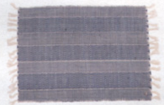
Akola Placemat, $16, wisteria.com

Not everything in the kitchen needs to be a splurge. Hardware, lighting, serveware, linens—these pieces really personalize your space, but will be the first to get updated down the line.