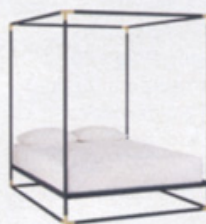
Frame Canopy Bed, from $699, cb2.com